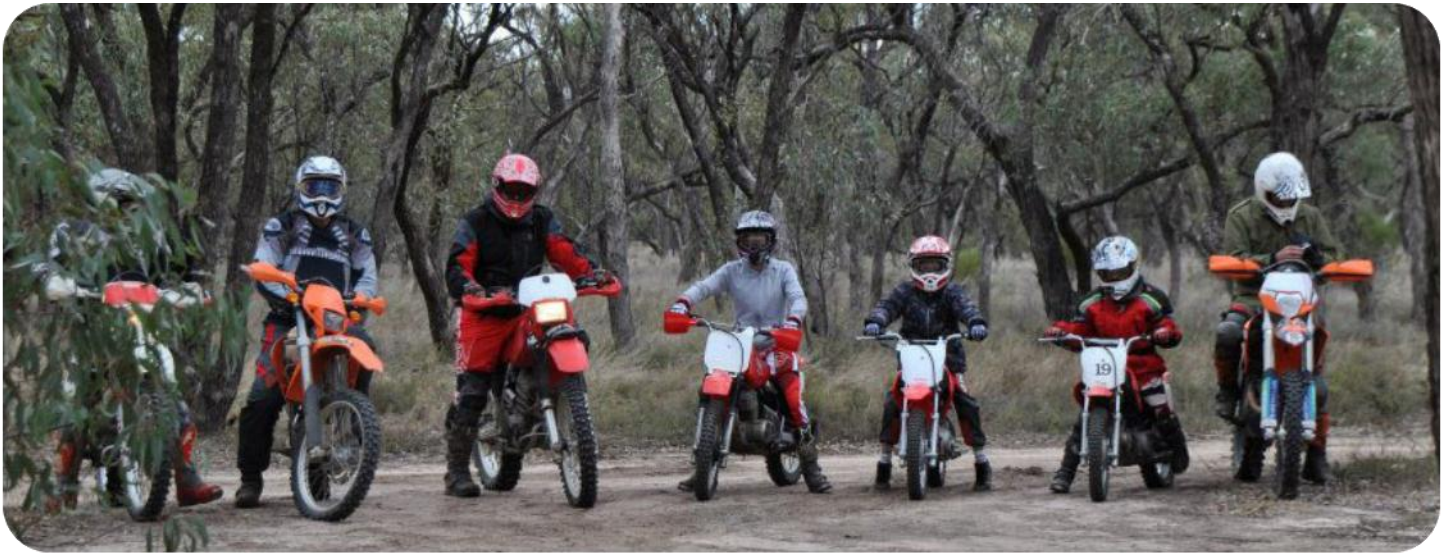
Above..... The kids get set for a ride around the Lake